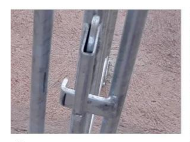
Self Locker easy and convenient