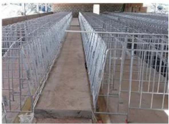
Easy for statistical management Statistical listing is not easy to make mistakes, it is easy to clean and management