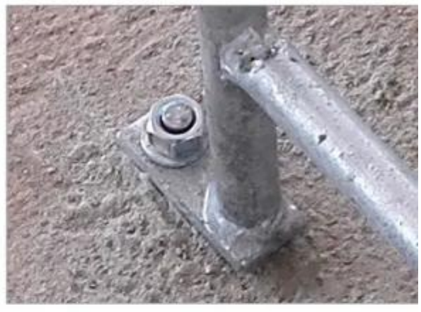
Galvanized footboard Corrosion resistant